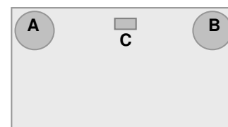
Figure 1: Connectors and setting

EFIS do not require any software configuration; you may reconnect MCP power supply and start it up, the MCP will scan the line and will detect the EFIS selector/s.